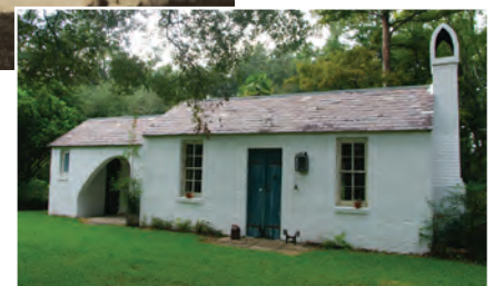
▶ Today it is known as the Garden House.