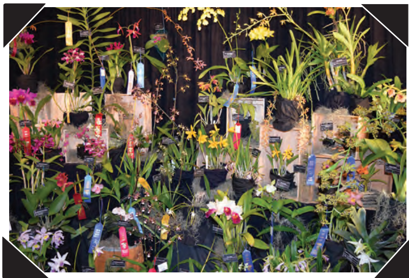
Baton Rouge Orchid Society show and sale at Burden