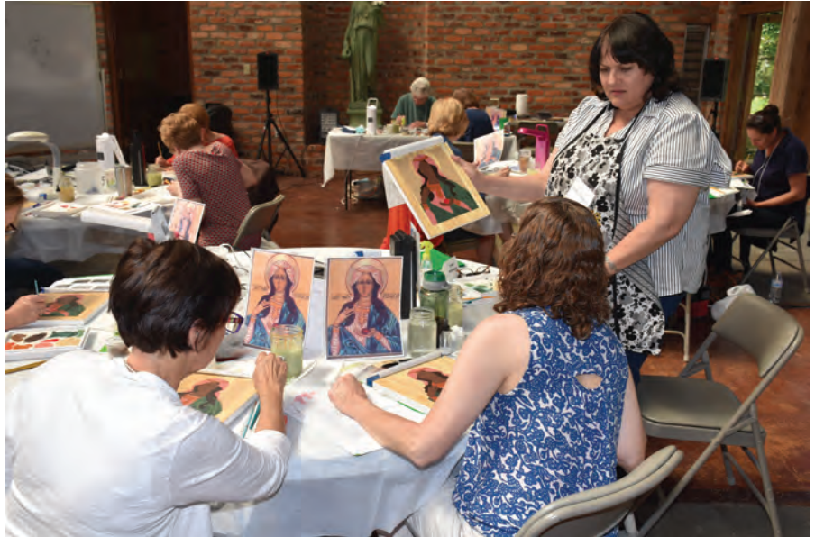
April icon workshop attendees focused on Mary Magdalene.

Each workshop brings improvements in the operation and instructions, draws additional participants who rejoice in the opportunity to learn this art form with minimal travel and causes an upsurge in interest throughout the community, which has actually led to the formation of iconography painting groups all around Baton Rouge. Although a majority of past partici-